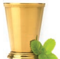
Gold Plated M37032GD