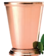
Copper Plated M37032CP