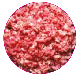
Minced Meat 18 Seconds