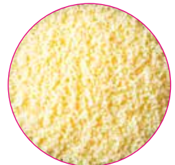
Cheese 30 Seconds