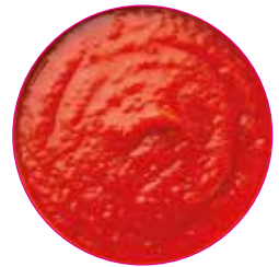
Pizza Sauce 18 Seconds