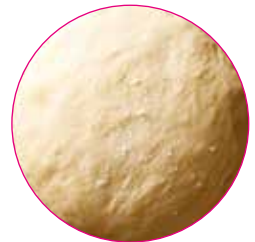
Dough Ball 45 Seconds