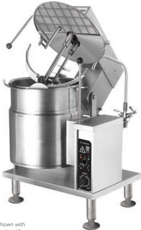
Shown with optional Faucet