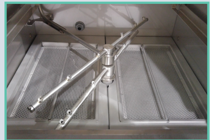
Interchangeable Scrap Baskets