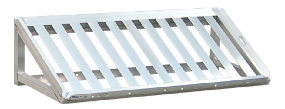
Slanted T-Bar Wall Shelf