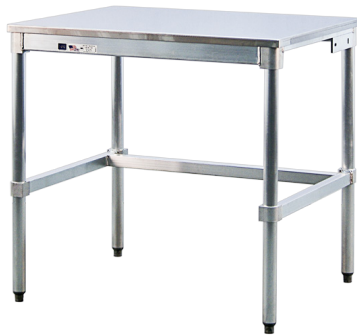
Solid Stainless Steel Top