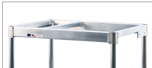
Table Frame is designed to accommodate optional accessories (sold separately): Boat rack, drawer, backsplash and undershelf.