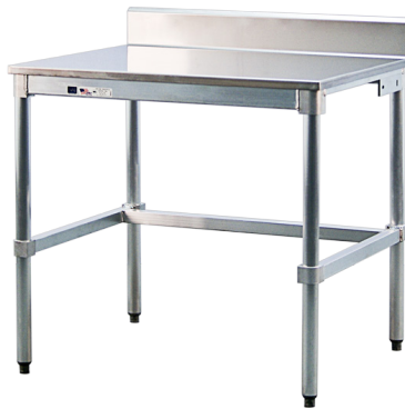
Stainless Steel Top With Backsplash