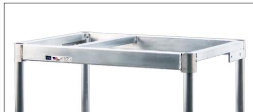
Table Frame is designed to accommodate optional accessories (sold separately): Boat rack, drawer, backsplash and undershelf.