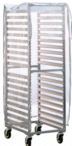
1359 | Clear Vinyl Cover