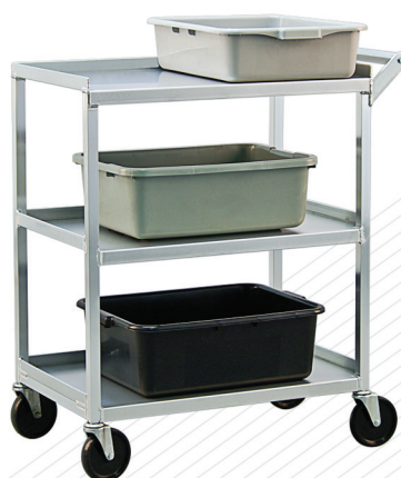
NS745 | Utility/Bussing Cart

LIFETIME GUARANTEE against rust and corrosion.