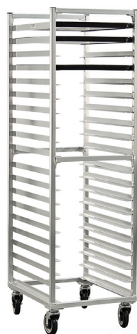
1331 | Heavy Duty Pan Rack