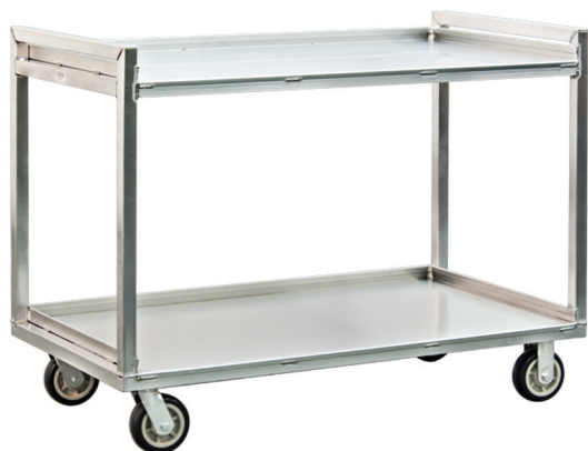
97180 | Extreme Duty Utility Cart

The standard Utility/Bussing Cart has three shelves with three lips up, and one lip down, to help hold products on shelves.