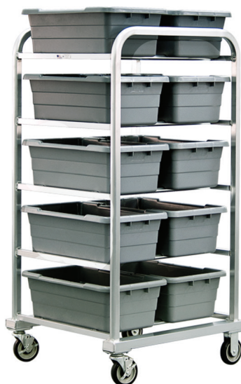
1264 | Heavy Duty, 10-Lug Dolly

Available in several sizes, our Lug Dollies are designed to handle bulk items. Lugs slide easily in and out of place and perform a multitude of tasks including transport and storage.