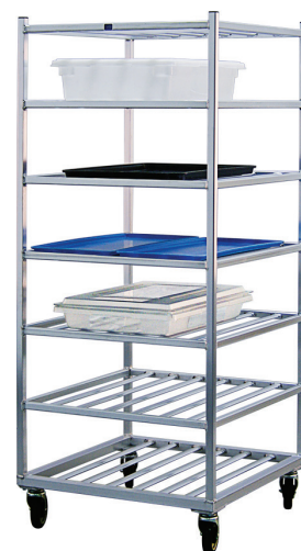
1357 | Universal Cart