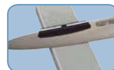
K-4G In Use