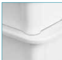
Seamless fit for fresh storage