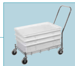
Transport dough boxes