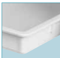
Reinforced edges & corners