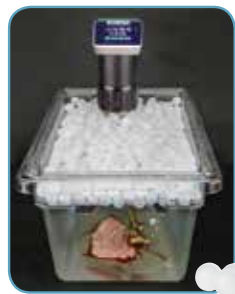
ESV-1 with ESV-IB insulation balls, to reduce evaporation and hold heat in