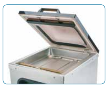
11-1/2" seal bar with bag clamp