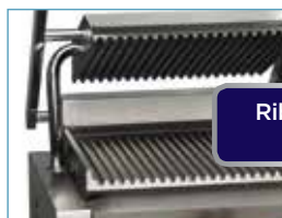
Ribbed grilling surfaces