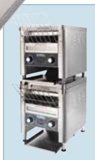
2 vertically stacked conveyor toaster units