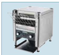
Stacking kit shown on conveyor toaster