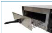
12" or 16" wide tray