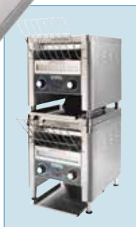
2 vertically stacked conveyor toaster units