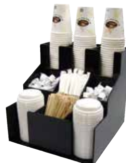
CLSO-3T 12-5/16"L x 12-3/4"W x 13-1/8"H