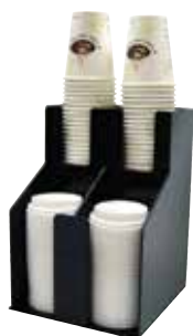
CLO-2D 8-1/2"L x 8-5/8"W x 12-1/4"H