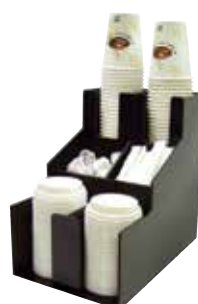
CLSO-2T 8-1/2"L x 13-1/16"W x 12-3/16"H