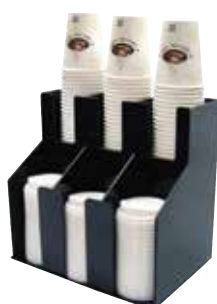
CLO-3D 12-11/16"L x 8-5/8"W x 12-1/4"H