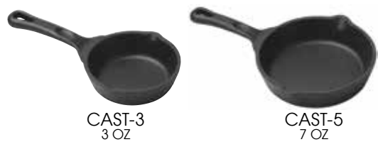
CAST-3 3 OZ