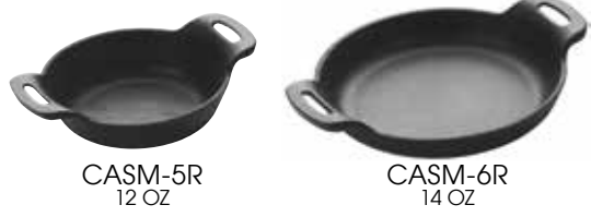
CASM-5R 12 OZ