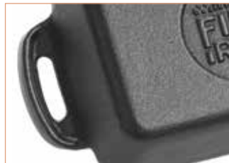
Specially designed lip under the handles for a secure grip