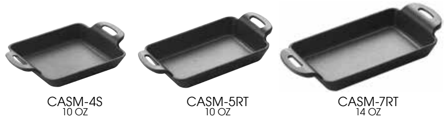
CASM-4S 10 OZ