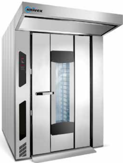
^ Rotating Double Rack Bakery Oven

Design excellence allows for access from the front, inside, and even the top for routine maintenance and repairs.