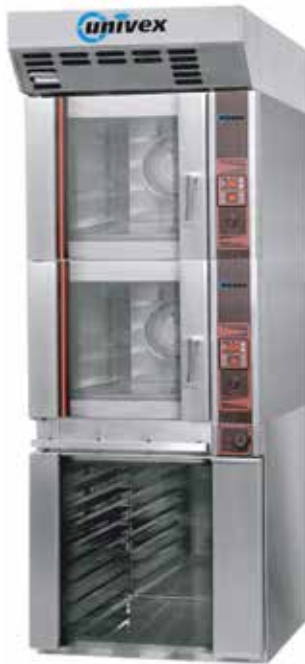
^ 5 Tray Bakery Ovens on a Proofer

OPTIONAL — Steam, Fan speed control, Puff pastry option, Touch screen control