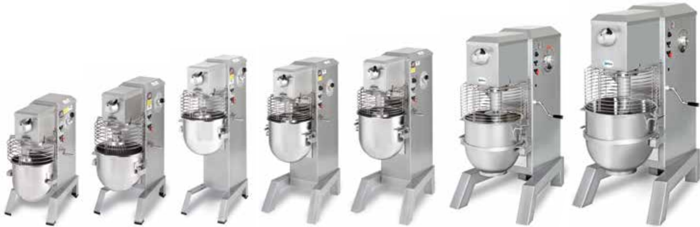
^ SRM12+ ^ SRM20+ ^ SRMF20+ ^ SRM30+ ^ SRM40 ^ SRM60+, SRM60+PM, SRM60+HD ^ SRM80+

Univex planetary mixers range in size from our SRM12 12-quart countertop mixer, ideal for small batch mixing needs, to the SRM80+ 80-quart floor model mixers, designed for bakery, high-volume pizza, and institutional operations.