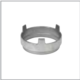
SS Bowl Bowl Truck Adapter Splash/Ext. Ring Bowl Truck