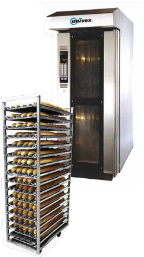
^ Roll in Fixed Rack Bakery Oven

OPTIONAL ELECTRIC: Available in 4 sizes and from 1 to 3 decks.