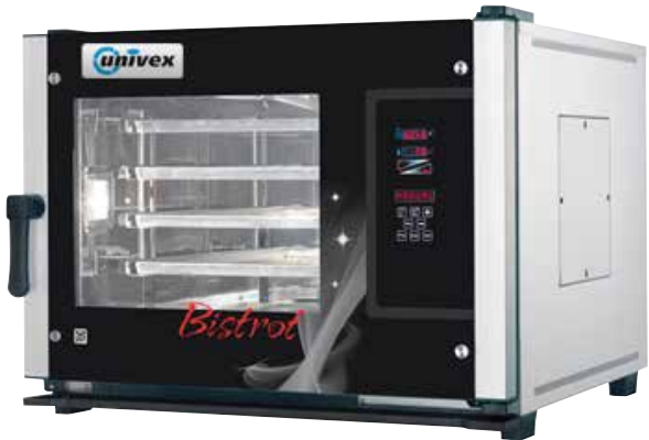
^ Multi-purpose Oven

Touch screen control panel with multiple-user programs simplifies usage while internal lighting facilitates product view. Stainless steel baking chamber features rounded corners for easier cleaning and better airflow. Double glass panel with low heat emission can be easily disconnected for cleaning.