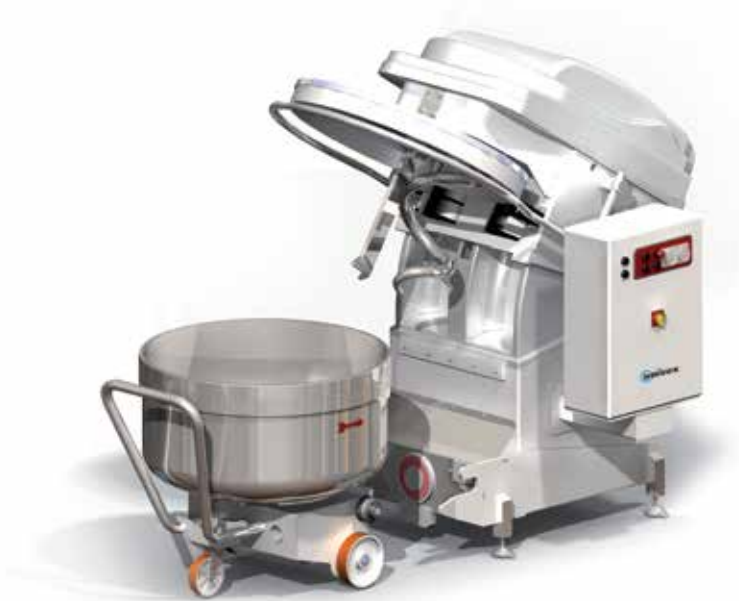
^ Silverline Mixer with Removable Bowl

Reliability – Silverline mixers are built to perform under even the most demanding conditions, day in and day out, with service requirements so low they are practically maintenance-free.