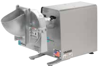
^ VS2000 Vegetable Slicer/Shredder

SLICER/SHREDDER The heavy-duty, high-volume Univex VS2000 Vegetable Slicer/Shredder makes short work of cabbage, lettuce, potatoes, onions and other vegetable slicing and shredding jobs with a powerful 1-HP motor that drives the included 9" VS9 Vegetable Slicer at 700 RPM. Nine-inch "S" Knife Vegetable Slicer and plate holder (hub and shaft) with a 5/16" shredder plate come standard.