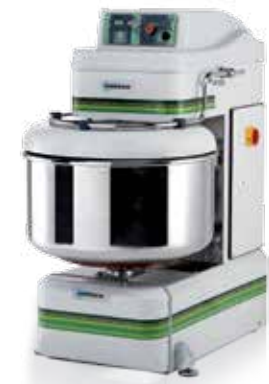
^ Greenline Mixer GL80

These professional-grade spiral mixers are ideally suited to high volume pizzerias, bakery shops and industrial settings