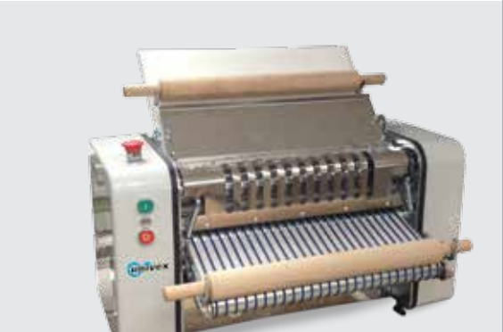
^ T50 Vertical Dough Sheeter

Our comprehensive line of elegantly designed, proven equipment offers dependable solutions for all of your bakery needs.