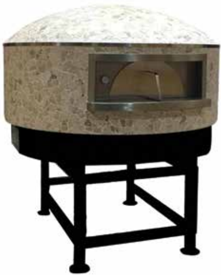
^ Stone Hearth Pizza Dome Oven - Round Dome

SURFACE — Surface of refractory borders are 6 cm deep to guarantee superior heat containment and gradual heat release. Large baking surface always stays warm: refractory bricks absorb sufficient heat to cook pizzas continuously, without need for pauses in between baking. Surface this deep offers improved resistance and prevents borders from moving, (which could create uneven levels after long-term use).