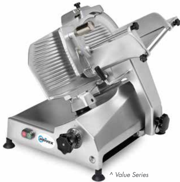
^ Value Series

Powerful enough for eight hours of continuous use, our Value Series slicers are great for medium- to heavy-use environments. These slicers are equipped with the horsepower and weight necessary to ensure continued production of precision slices from 0 to 7/8" thick. Four models are available with manual or semi-automatic controls.