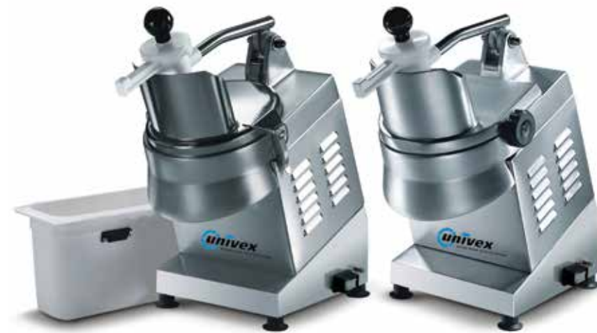
^ Food Processor