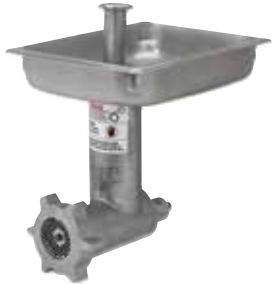
^ ALMFC12 Meat Grinder