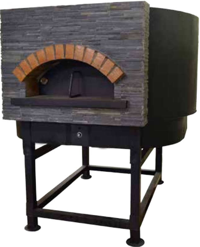
^ Stone Hearth Pizza Dome Oven - Round

DOMES — Made of whole refractory bricks, furnace baked, with high alumina content, immersed in refractory cement casting. Resistant to 1200°C. High alumina content increases heat retention. Ovens turned off in the evening still warm next day. Bricks have sufficient resistance to double oven lifespan.