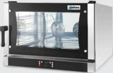
^ Snack Oven

Univex multi-purpose convection ovens adapt with ease to a wide range of working environments, from bars to supermarkets, pizza parlors to self-service snack areas. They function well independently, and also in combination with leavening units and other accessories that can augment both their performance and efficiency.