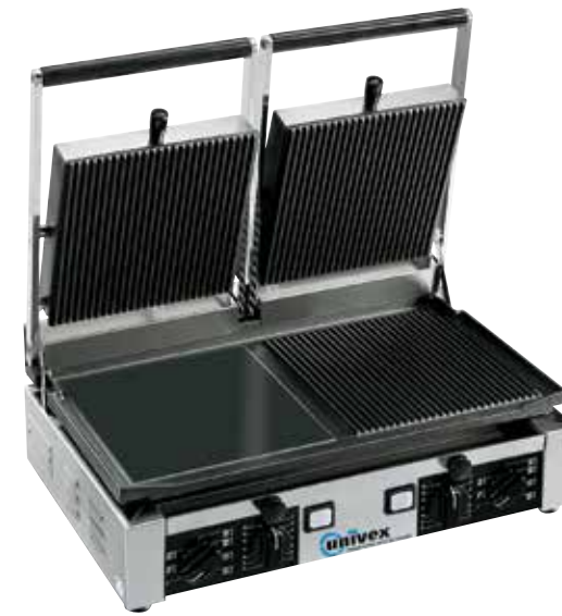
^ Panini Press

Our Food Processor is a versatile vegetable prep machine capable of preparing up to 485 pounds of fresh vegetables, fruit, and more per hour and the unique feeding system makes it easy to process soft products, like mozzarella cheese. A heavy-duty, ventilated motor enables a worry-free and continuous operation. While our compact design makes it an ideal addition to any kitchen with quick and easy installation. Designed with safety in mind the motor stops when the lever is lifted, the machine will not start if cover is not in place.