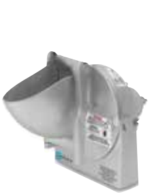
^ VS9H Grater/Shredder