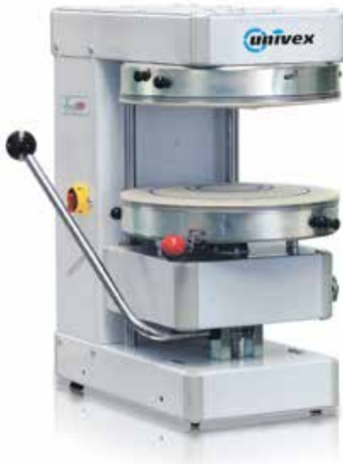
^ Sprizza SSPZ40 / SSPZ50

Our one-of-a-kind dough spinner produces perfectly spun pizza dough in seconds. The Sprizza does not press your dough, but rather spread it with its patented micro-rolling system, in essence replicating the product previously only achieved by traditional hand-tossing. With the ability to adjust and set the dough thickness and the versatility of managing your desired crust height, the Sprizza is designed to deliver the consistency you demand and the efficiency you deserve.