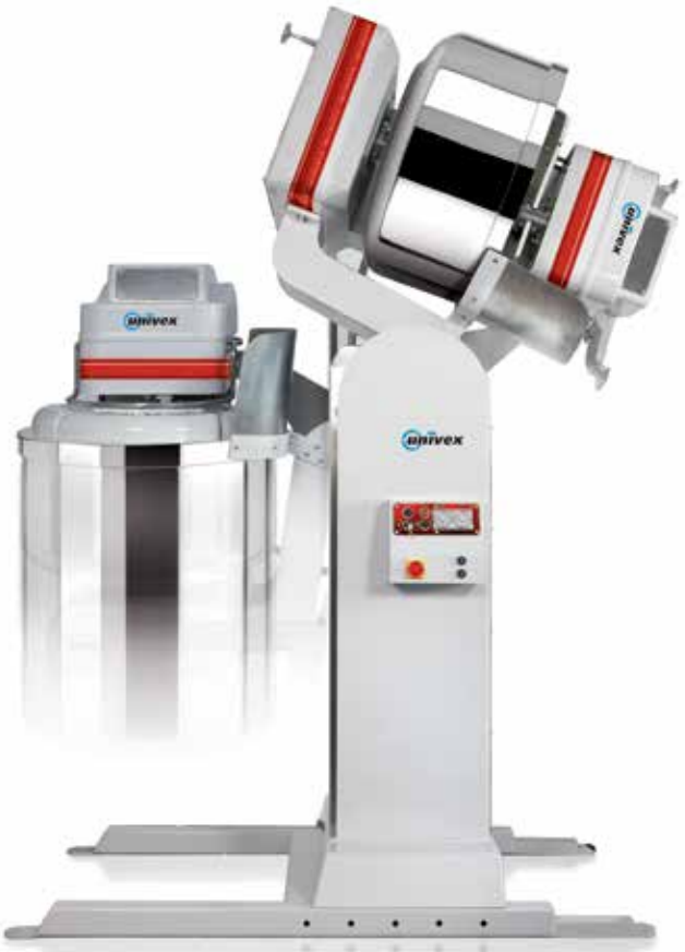
^ Overturnable Mixer

OVERTURNABLE MIXERS The OTM line of overturnable mixers is available in models of 120, 160, 200, 280 kg. of dough. Once operator activates dumping control, unit automatically empties dough from bowl onto table, or into a divider. Designed to accommodate specific configurations, these models offer a cost efficient way of reducing the amount of manual labor required for dough processing. Built on a sturdy, reliable structure, OTM models can withstand intensive operation and require very little maintenance.