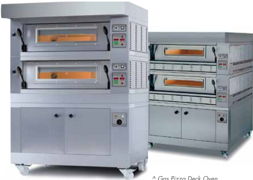
^ Electric Pizza Deck Oven

The oven is unique for two great reasons, the small footprint and the ability to access all components and electrical box from the front of the machine. This means one does not have to move the oven to perform maintenance. All gaskets are replaceable without the use of tools and the glass is easy to clean. All these things added up gives you an amazing oven with a small footprint, easy maintenance, and amazing baking quality.