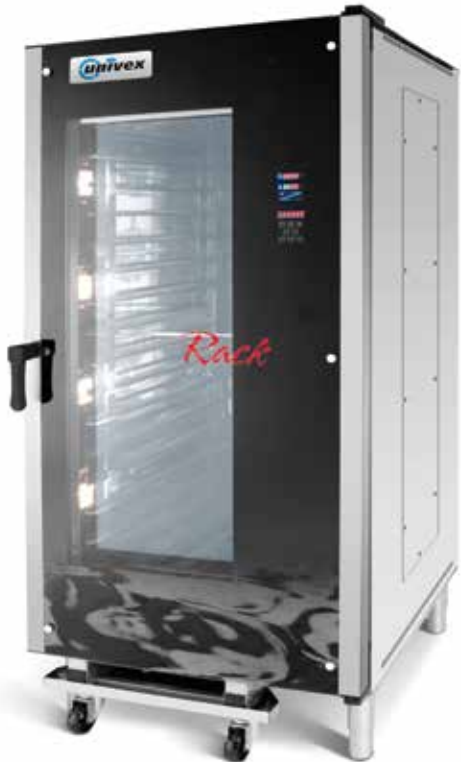
^ Multi-purpose Rack Oven