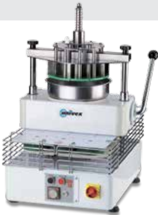
^ DR11/14 Dough Divider-Rounder

This semi-automatic dough divider-rounder model is able to cut and round 600-800 pieces of dough per hour. Portions can weigh from the smallest 3 to 11 oz. with the cutting group dividing into 14 sections, and from 11 to 23 oz. with the cutting group dividing into 11 sections. The machine is extremely easy to use, compact and very practical.