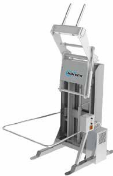
^ Twin Piston Spiral Bowl Lifter

WHEN YOU NEED A LIFT Univex spiral bowl lifters put the power where you need it, find yours right here.