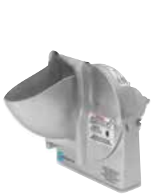
^ VS9 Vegetable Slicer

Univex mixers have a #12 attachment drive hub that allows you to operate a food processing attachment off the mixer motor. A number of specialty attachments are available, including the VS9 Vegetable Slicer with a 9” adjustable knife for slicing such product as onions, peppers or ham with ease; the VS9H Vegetable Grater/Shredder, available with shredding discs in multiple sizes; and the ALMFC12 Meat Grinder, with a variety of plate sizes for grinding meat or sausage or producing ground hamburger.