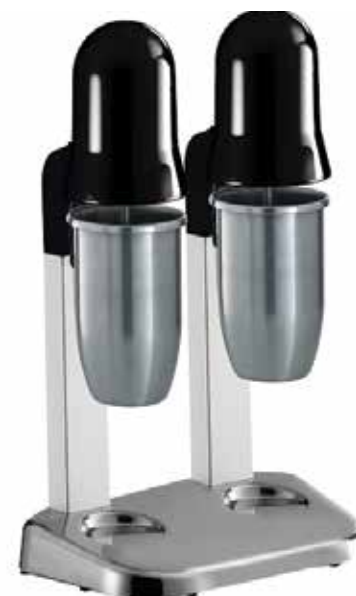
^ Milkshake Blender

Note — Milkshake blender is designed to mix cold liquids, flavorings, and other liquids together while aerating the mix. It is not designed to combine solids and liquids like ice cream and milk.