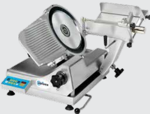
Carriage tilts back for easy cleaning.

All Univex slicers are built to meet the sanitation and safety needs of the modern food service industry.