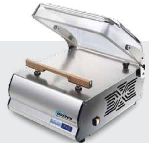
^ Vacuum Packer

Designed with an intuitive electronic control system, which features 8 different savable settings with a pump meter, oil pre-heat, and cleaning cycle. Additionally, there is an oil change warning light, 6 selectable languages, and an adjustable automatic vacuum percentage. The full control vacuum packer is fully equipped with gas injection and multiple thermal label printing options. Our Vacuum Packers are easy to clean with a thick transparent Plexiglass lid for viewing. The automatic cover lift is operated by pneumatic pistons.