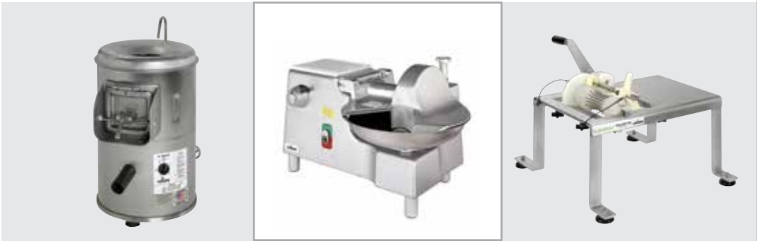
G-Peeler Bowl Cutter PerfectPeeler™ Melon Peeler

PEELERS G-Peeler — Maintain the fresh, nutritious flavor lost in frozen and pre-cut vegetables and cut costs by peeling your own vegetables with the portable Univex G-Peeler, capable of peeling 20 pounds of potatoes, carrots or other root vegetables in less than two minutes and with less than 10% waste! Its built-in timer prevents over-peeling and waste. The G-Peeler can also be used to clean shellfish and scale small fish.