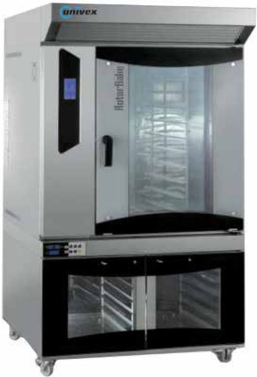
^ Rotating Half Rack Bakery Oven