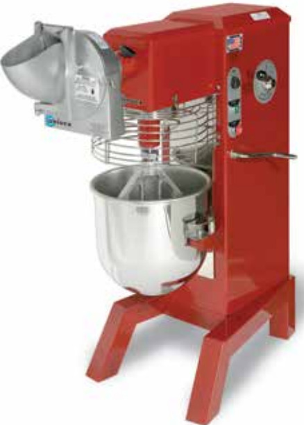
^ SRMF20 with VS9