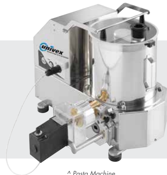
^ Pasta Machine