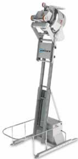
^ Adjustable Spiral Bowl Lifter

Discharging structure features two, perfectly balanced pistons. Device mounted on stand with support and fixing legs adaptable to requirements of lifter. Inside the support, an oversized hydraulic control unit facilitates continuous use. Trolley operation area protected by ring beneath bowl itself. Operator can close unit in box with a safety gate to secure potential danger zone. Max overturnable weight 800 kg.