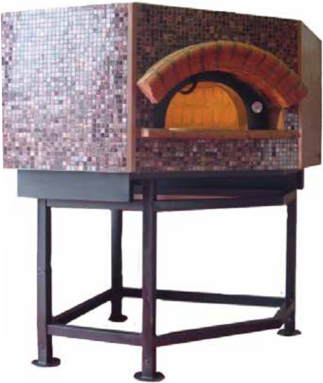
^ Stone Hearth Pizza Dome Oven - Pentagonal