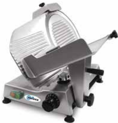
^ Economy Series

For occasional, light-duty use, our Economy Series of compact manual slicers offers big-time performance at an affordable price. Each features a belt-drive blade powered by a sturdy motor, plus a removable carriage and smooth, polished anodized aluminum construction for easy cleanup and maintenance. Slice thicknesses are infinitely variable from 0 to 1/2". Choose from two models in 10" and 12" blade sizes with a maximum usage of two hours per day.