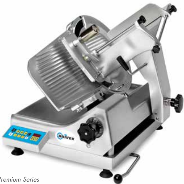
^ Premium Series

For larger operations such as a supermarket deli, school or hospital, a semi-automatic slicer is the ideal choice. It allows you to slice a lot of product at once, and provides precise repeatable slicing without constant supervision. Our medium- to heavy-duty Value and Premium series semi-automatic models provide a maximum usage of 8 and 12 hours, respectively.