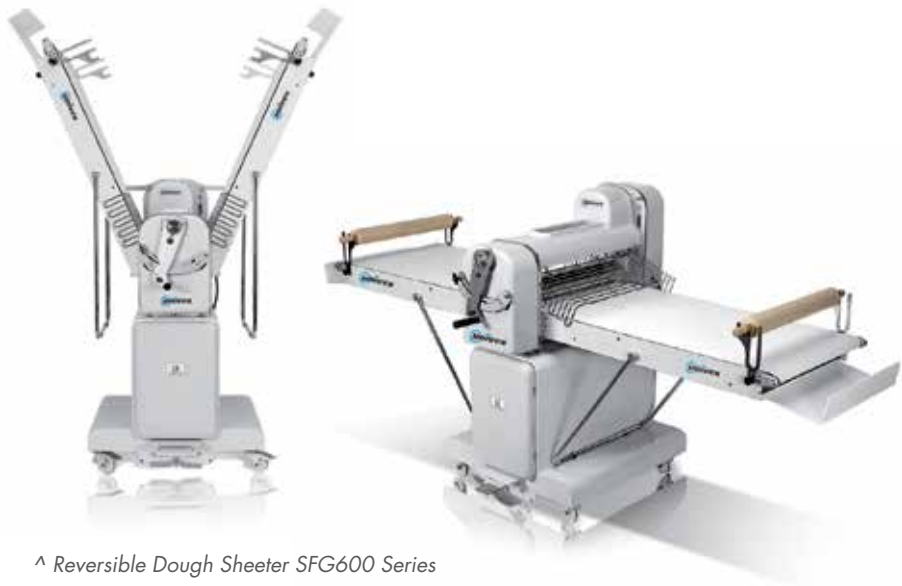
^ Reversible Dough Sheeter SFG600 Series

Sheeter tables feature perfectly synchronized drives. Exit conveyor is faster than entry to avoid possible dough obstruction and prevent tearing of delicate dough. These units also sheet dough onto rolling pins to allow longer than out-feed table length sheets of dough. The versatile SFG600TL features variable speed and cutter rollers in different shapes and sizes (contact factory for details). The SFG500 comes in both bench and floor models. All sheeter tables, (except models TMM and TL) fold upright for easy storage.