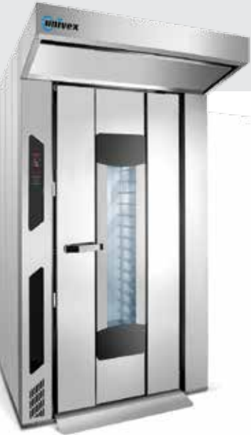
^ Rotating Single Rack Bakery Oven

Energy savings: 30% - major cut in running costs