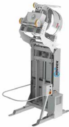
^ Spiral Bowl Lifter

Tipper for spiral mixers equipped with removable, wheeled bowls. Sturdy, electro-welded, steel structure with slide guides and trolley. Simple, reliable construction designed to resemble premier lift trucks. Lifting and unloading happen in rapid succession thanks to powerful hydraulic piston and double chain. Available in three different discharge heights: 1.3 mt, 1.9 mt and 2.6 mt, for use with SL80RB - SL200RB. Maximum lift is 400kg.