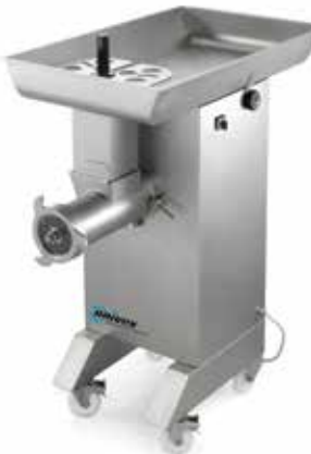
^ MG34 Meat Grinder