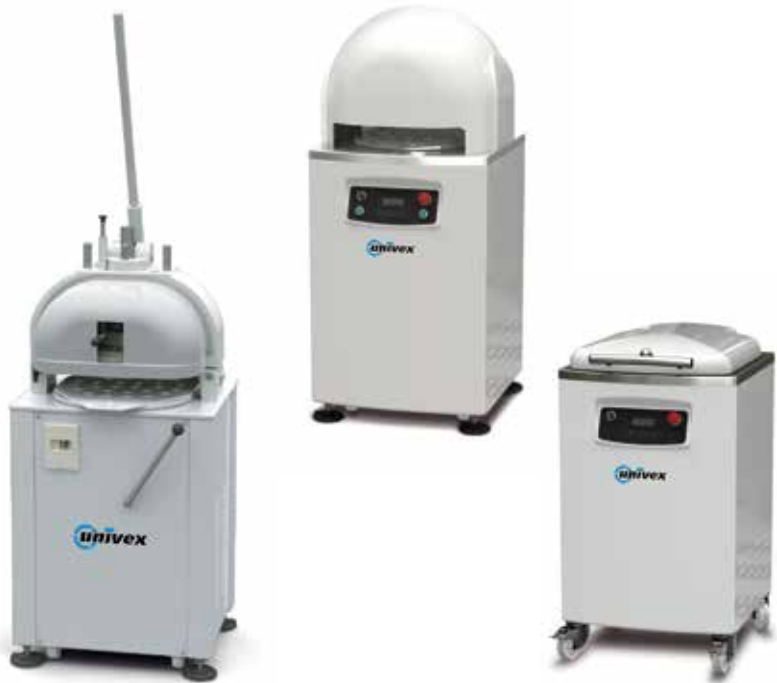
^ Semi-Automatic Bun Divider Rounder/Automatic Bun Divider Rounder/Rectangle, Square or Round Bun Divider Rounder

The vertical sheeter can do anything a reverse table sheeter can do, in settings where space is at a premium. Both practical and easy to use, its unmatched versatility allows you to sheet pizza dough, square pan pizza, fondant, puff pastry and fresh pasta with equal effectiveness.