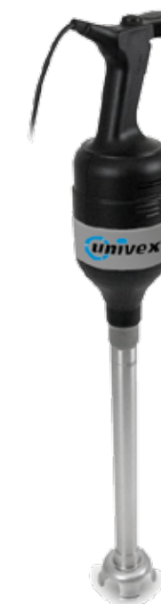
^ Hand Mixer