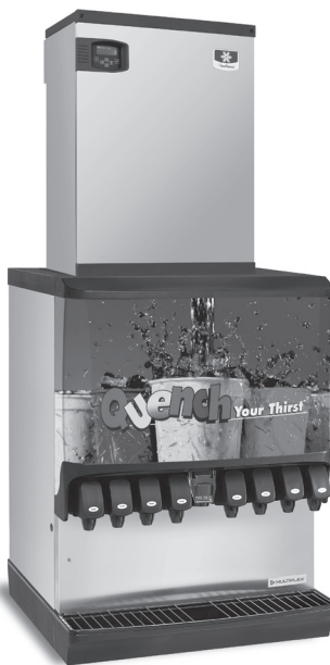
SV-250 with IB1090C Ice Machine