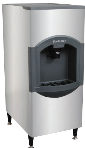
Easy Push Chute