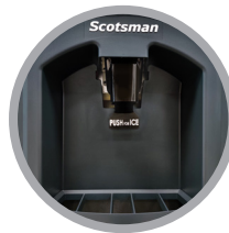
Optional sanitary lever dispensing kit available (KHDSANLV)