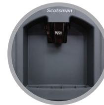
Standard easy push chute