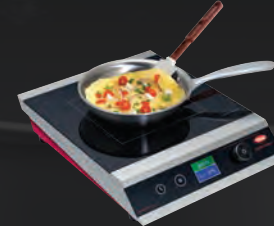
Rapide Cuisine® Induction Ranges MODEL IRNG-PC1-18 SHOWN