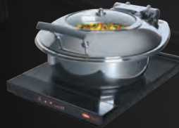
Palletti® Induction Warmers MODEL IW/RM-C1-1317-06 SHOWN