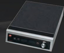
Boxer® Induction Ranges MODEL IRNG-BXC1-18 SHOWN