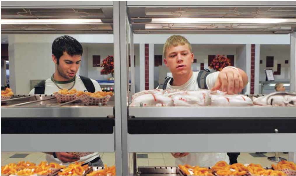
GRSDS-36D with dual slanted shelves