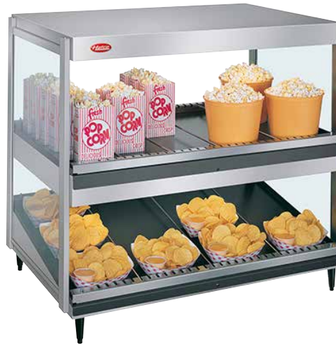
GRSDS/H-36D with slant and horizontal shelves and optional 15" clearance top shelf