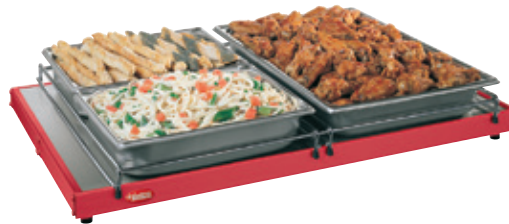
GRS-30-I in optional Designer color with accessory pan rail and food pans