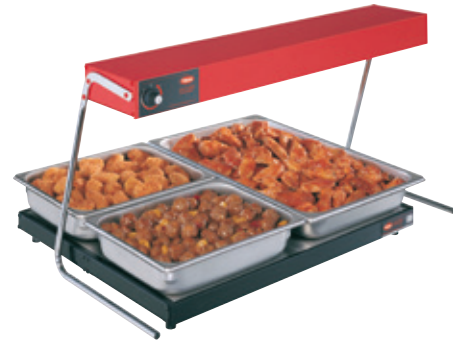
GRS-30-I in optional Designer color with accessory food pans, shown below a GRAH-36 Strip Heater