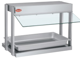
GRHW-1P with Accessory food pan