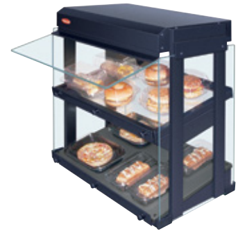
GRHW-1SGDS in Standard Designer Black