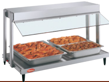
GRHW-2P with Standard 4" and Accessory food pans