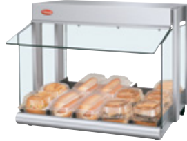
GRHW-1SG with Standard bins