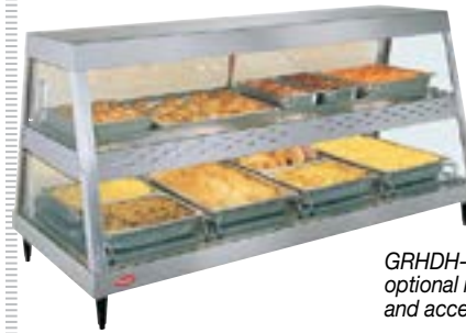
GRHDH-4PD with pan rail, optional mirrored glass doors and accessory food pans