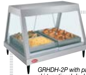
GRHDH-2P with pan skirt, optional double sided opening, and accessory food pans

For operation, location and safety information, please refer to the Installation and Operating Manual.