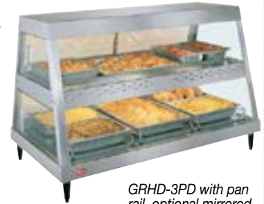
GRHD-3PD with pan rail, optional mirrored glass doors, and accessory food pans