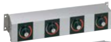
RMB-14E with infinite controls