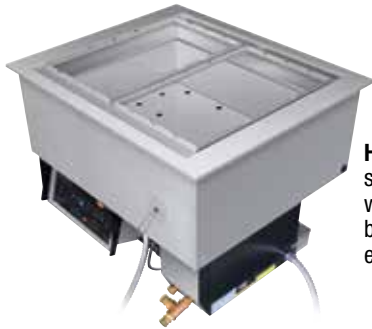
HCWBI-2DA shown in hot mode with heated pan support bars (included), designed for easier handling of food pans