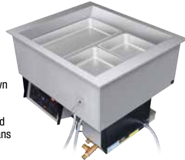
HCWBI-2DA shown in cold mode with cold pan support bars (included) and accessory food pans