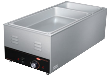
CHW-43 with accessory food pans and pan support bar (single unit holding 1 full-size pan and 1 third-size pan)