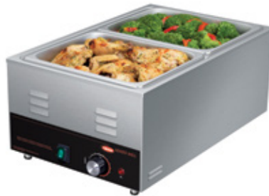
HW-FUL with accessory food pans and pan support bar