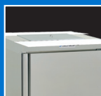
Double-sided Cutting Boards