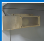
Interior LED Light