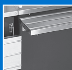
Tray Slide Mounting