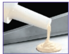
Pour batters and oils

Find replacement parts at www.carlislefsp.com/replacement-parts