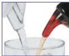
Perfect 2-1 drinks are easy