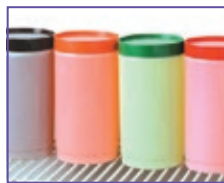
Stackable backup storage