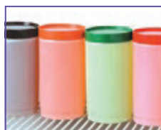
Stackable backup storage