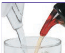
Perfect 2-1 drinks are easy