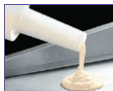
Pour batters and oils

Find replacement parts at www.carlislefsp.com/replacement-parts