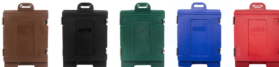
PC300N Available in 5 colors