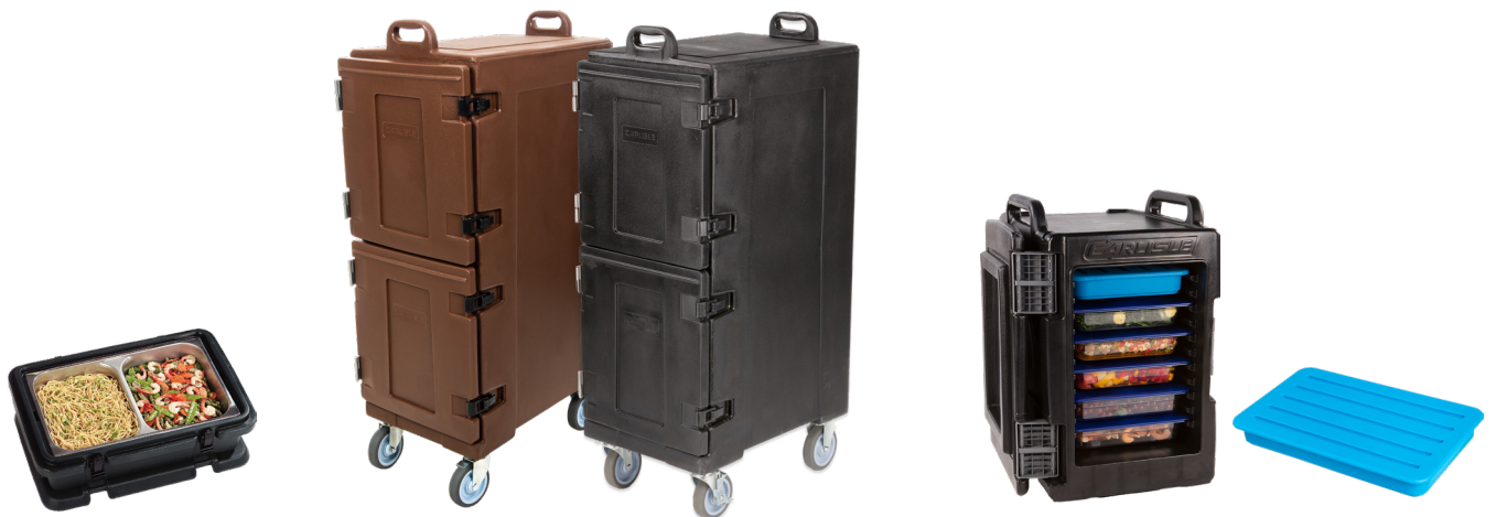
PC140N Available in 1 color