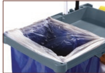
Tough 25 gallon nylon bag easily attaches to cart arm. Hooks on top of arm to hold trash liners in place. Arm swings up for more compact storage when not in use.