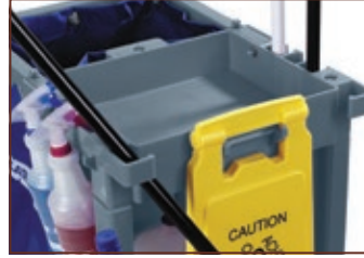
Front hooks hold most standard Wet Floor Signs. Built-in hanger holds multiple spray bottles.