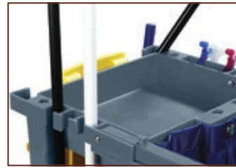
Integrated tool holders, shelves and hooks keep everything organized including unwieldy handles.