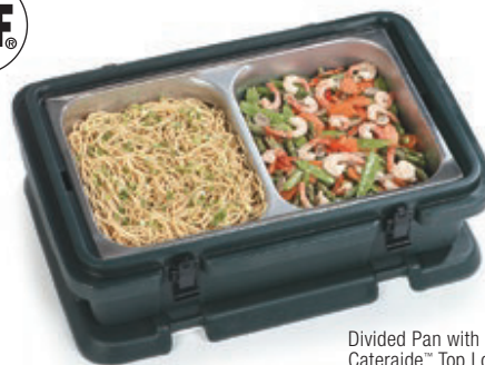
Divided Pan with PC140N Cateraide™ Top Loader