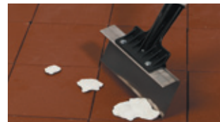
41619 - Floor Scraper