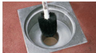
40146 - Floor Drain Brush 40236 - Drain Brush Handle