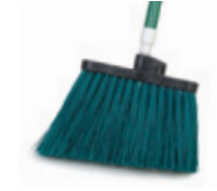
41083 - Duo-Sweep® Angle Broom