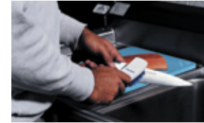
41395 - Knife Cleaning Brush