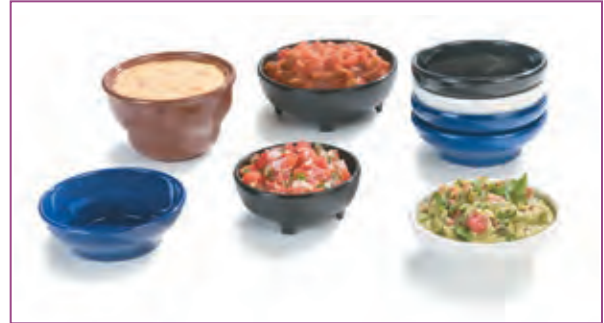
Salsa and Molcajete Dishes on page 58