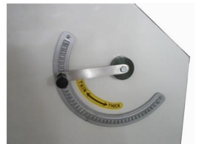
Side View of Handle Control for Dough Thickness

*Also available with red sides. Stock may vary when ordered. Please confirm with your dealer at time of purchase.