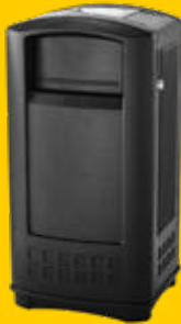
FG9P9100BLA PLAZA CONTAINER WITH ASH TOP