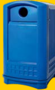
FG396873BLUE PLAZA RECYCLING CONTAINER