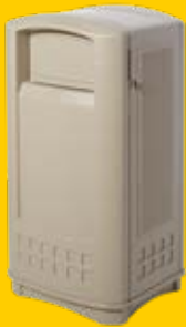
FG9P900BEIG PLAZA CONTAINER