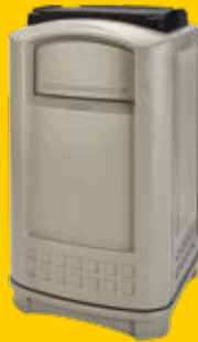
FG396300BEIG PLAZA CONTAINER WITH TRAY TOP