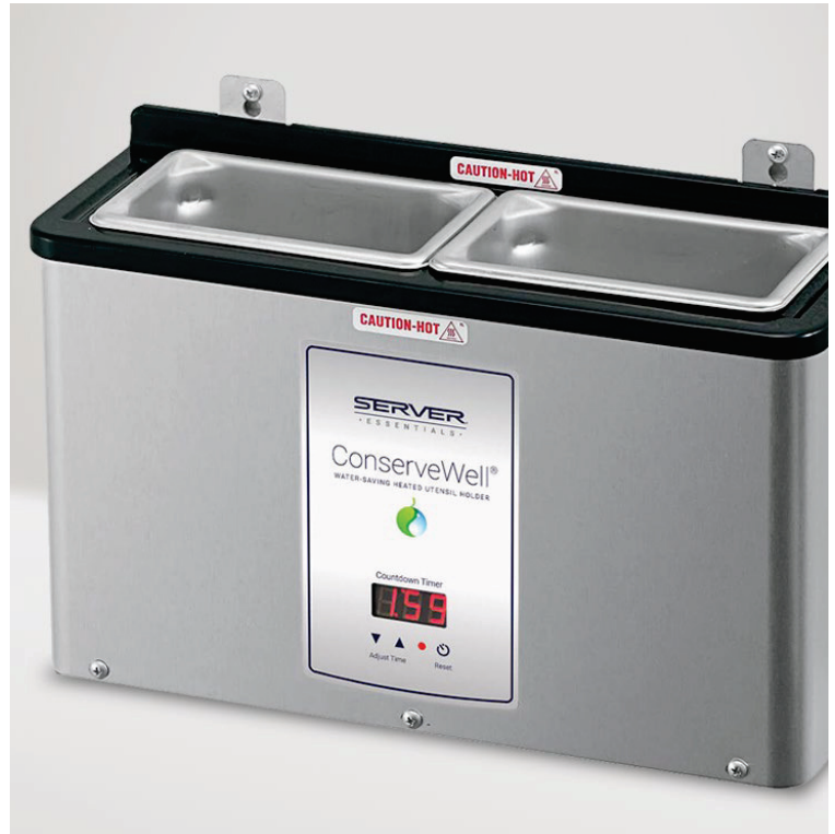
CW 87750 (w/timer)