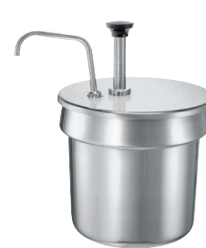
CP-10 1/2 83240