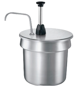
CP-10 1/2 2 oz 87680