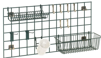
Wire Grid and Grid Brackets Not Included.

Accessories fit: 18" x 36" (457 x 914mm) of grid space