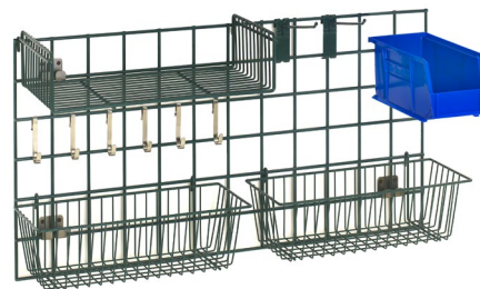
Wire Grid and Grid Brackets Not Included.

Accessories fit: 18" x 36" (457 x 914mm) of grid space