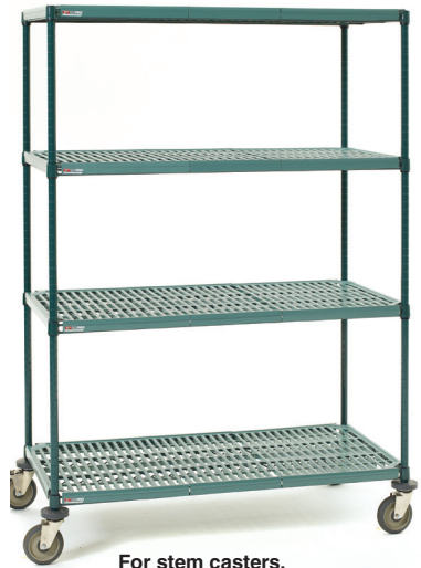
For stem casters, see catalog sheet #11.20