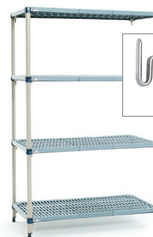
4-Shelf Add-On Unit