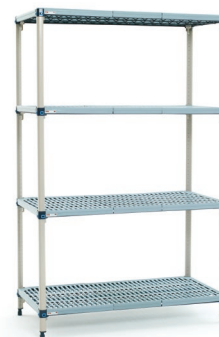
4-Shelf Starter Unit