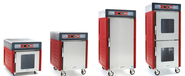
Under Counter Full Clear Door