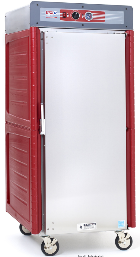
Full Height Full Solid Door