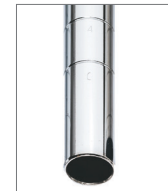
Post for Stem Caster