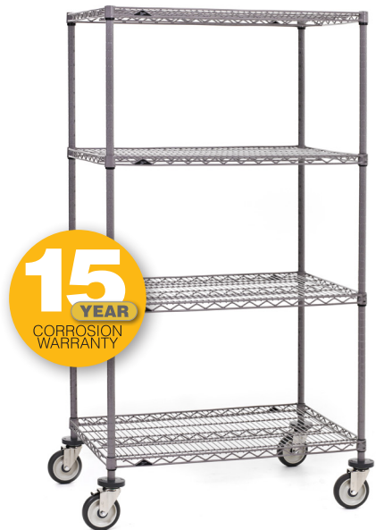
Super Erecta with Metroseal NSF listed for wet environments