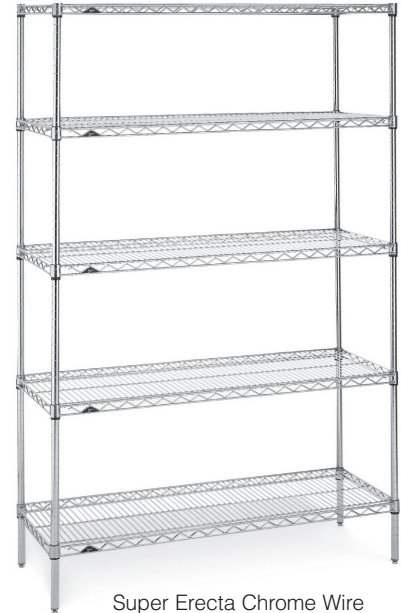
Super Erecta Chrome Wire

Note: Stainless stationary posts are equipped with stainless steel leveling feet.