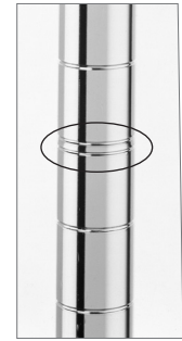
SiteSelect Posts feature double grooves every 8" (203mm) to aid assembly.

*96P should not be used on units less than 24" (610mm) deep. Consult Metro Engineering for alternate recommendations.